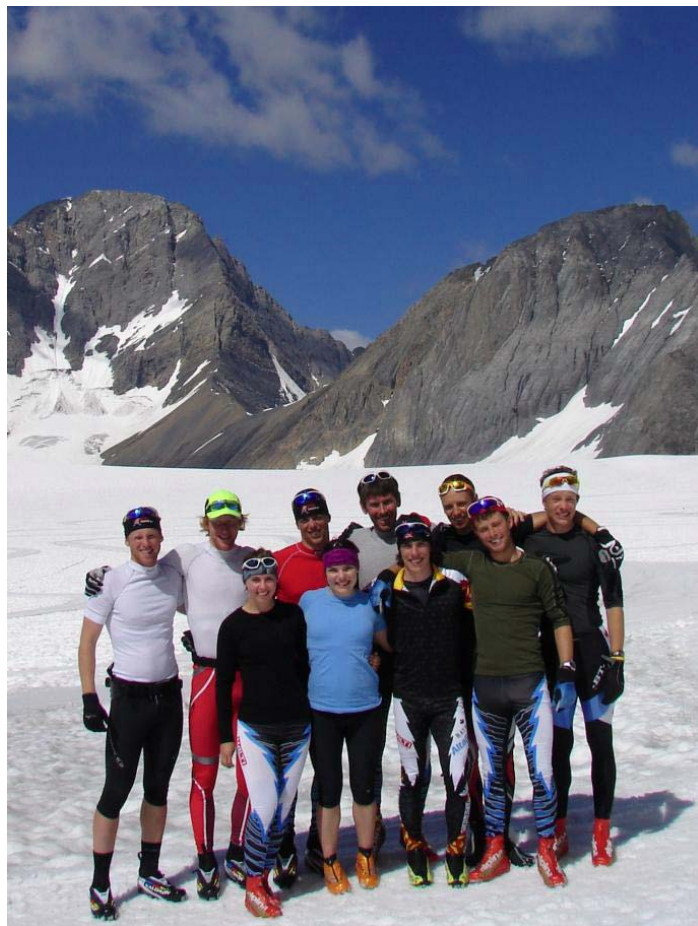
NDC Thunder Bay Team 2010/11