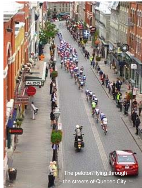
The peloton flying through the streets of Quebec City.